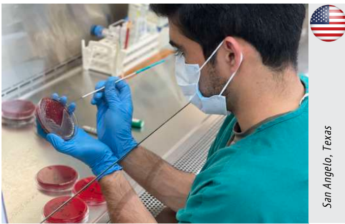
San Angelo, Texas

Bimeda also offers a range of diagnostic and analytical services, through diagnostic laboratories in the USA.