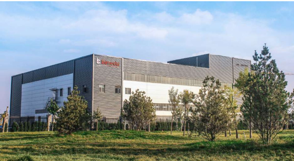
Bimeda Facility in Shijiazhuang, Hebei, China