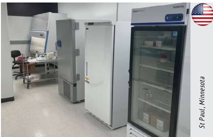
St. Paul, Minnesota